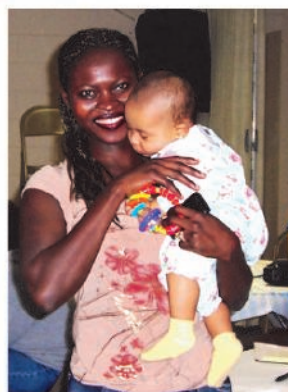
Photos from the Women's Fellowship meeting May 23rd.